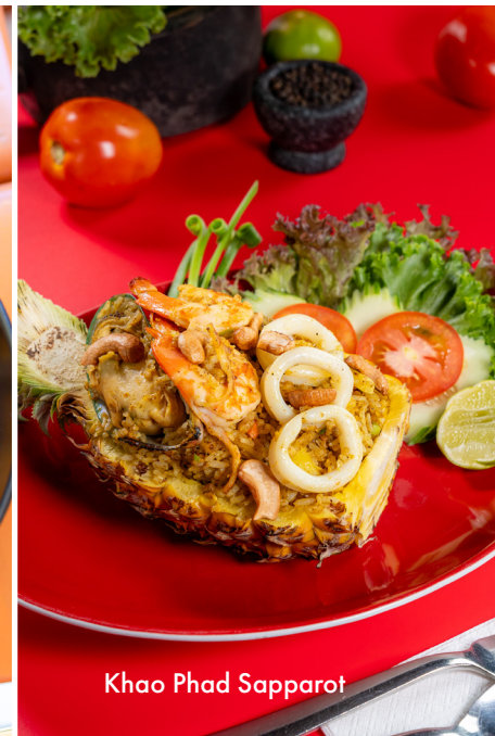
Khao Phad Sapparot