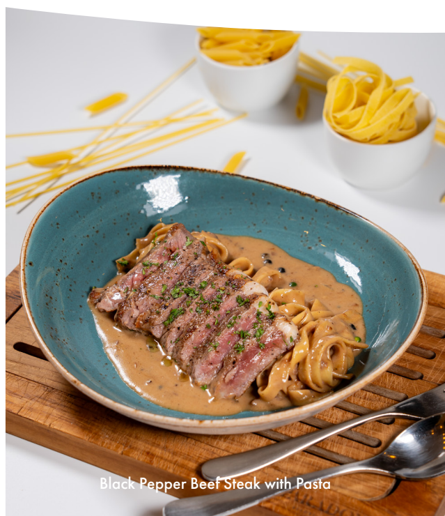
Black Pepper Beef Steak with Pasta