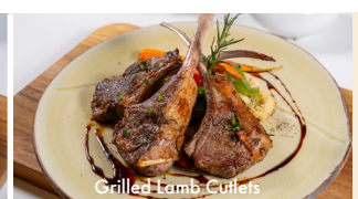
Grilled Lamb Cutlets