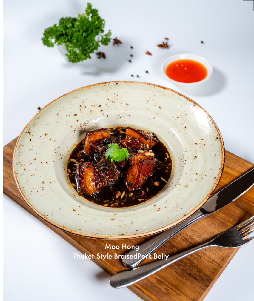
Moo Hong Phuket-Style Braised Pork Belly

* All Thai dishes are served with jasmine rice unless otherwise stated.