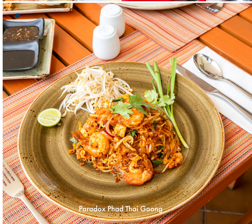
Paradox Phad Thai Goong