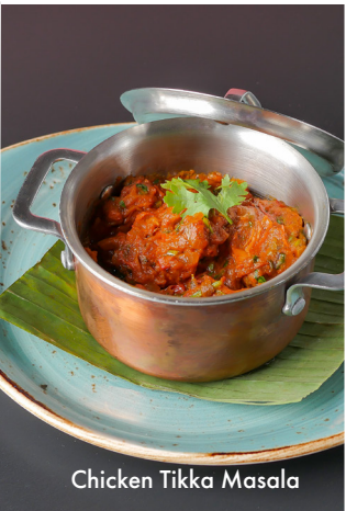
Chicken Tikka Masala