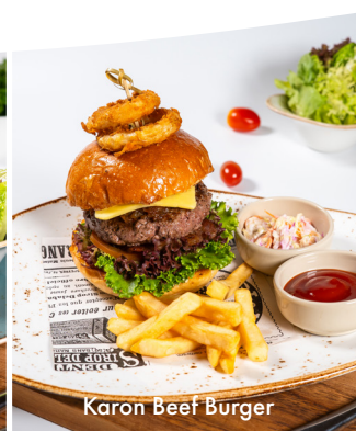
Karon Beef Burger