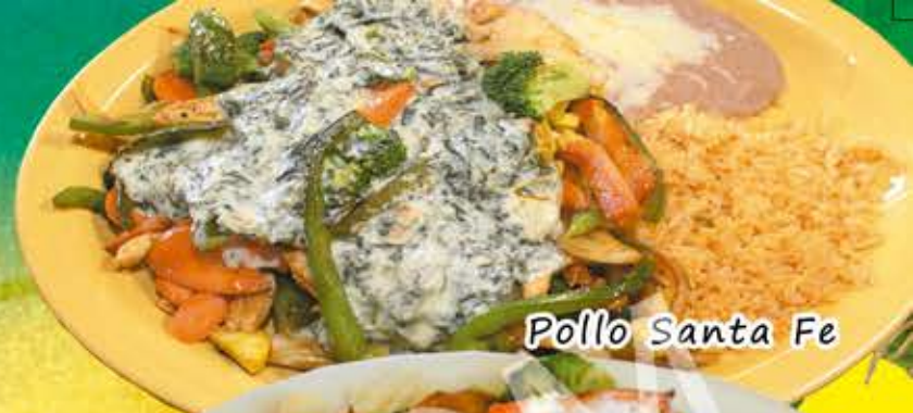
Pollo Santa Fe

French fries with grilled chicken, steak, or mix and cheese on top. 10.99