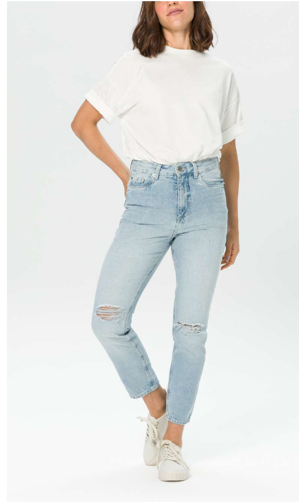
Mom Original Ripped 0/03