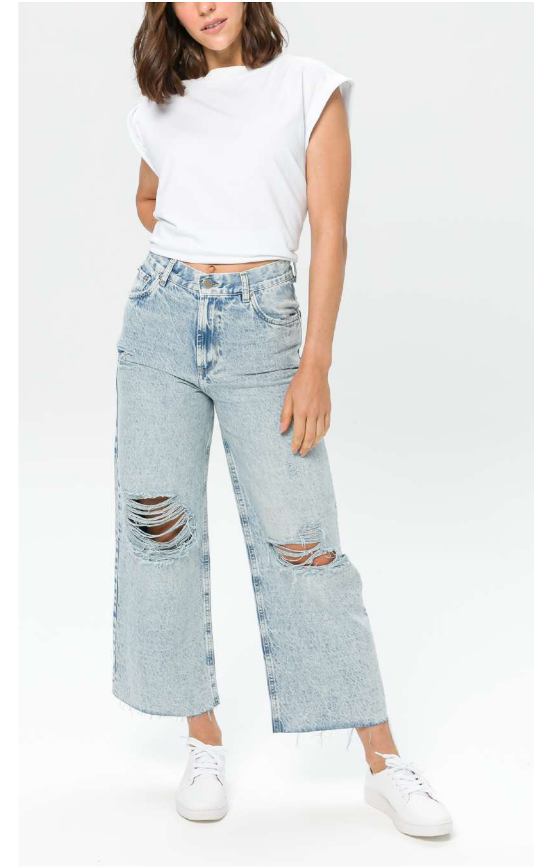
Wide Leg Original Ripped 0/03