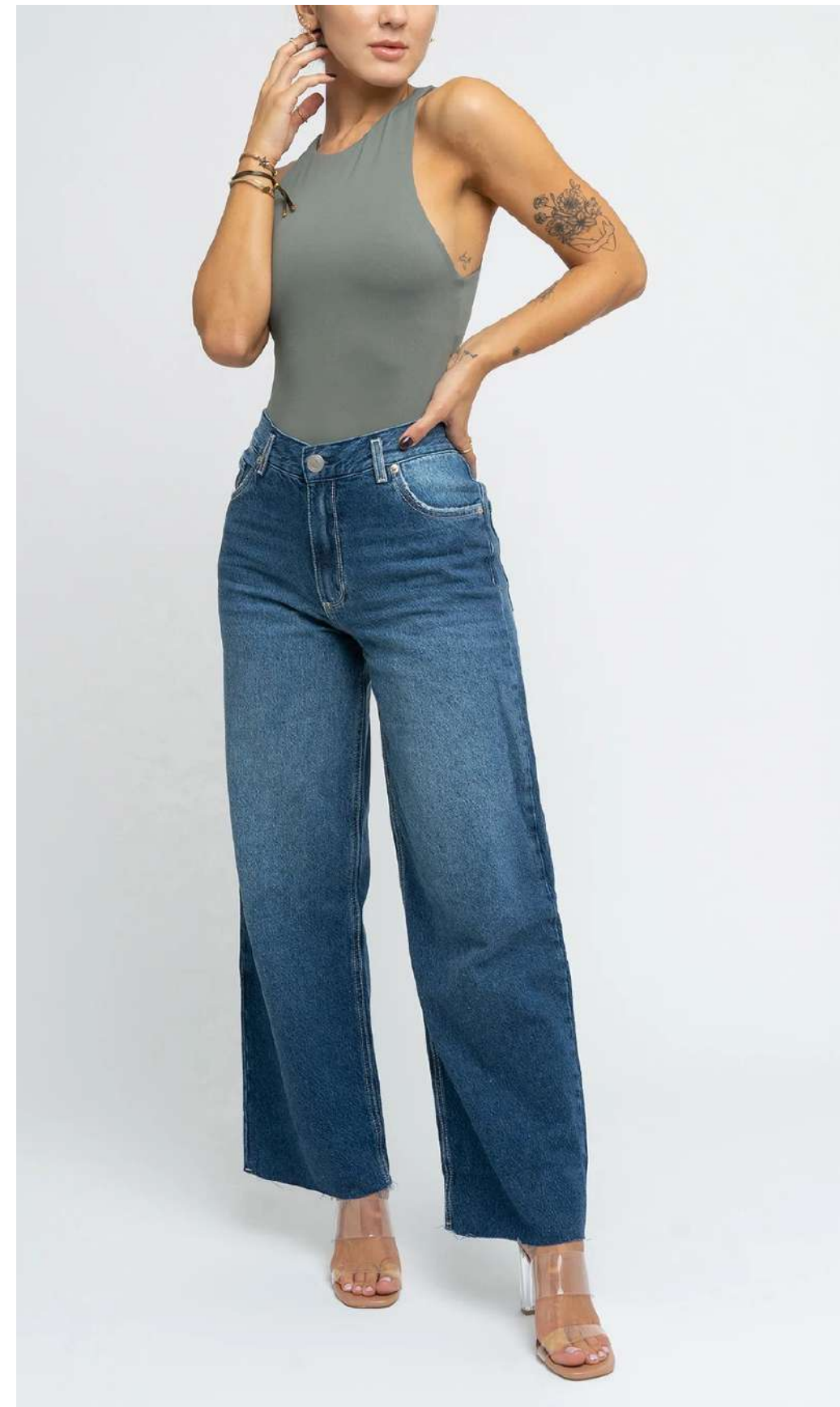
Wide Leg Original