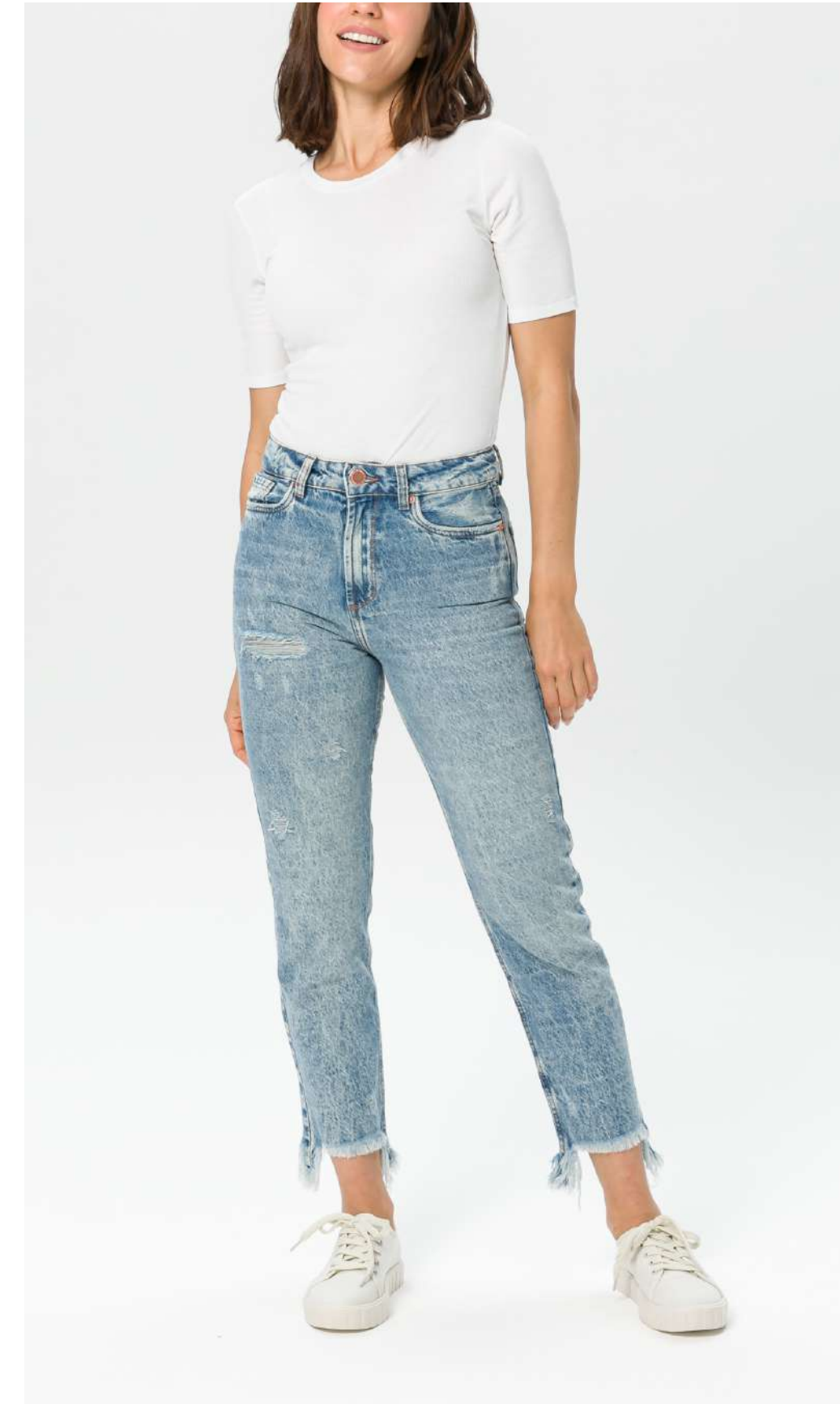
Straight Original Ripped 0/02