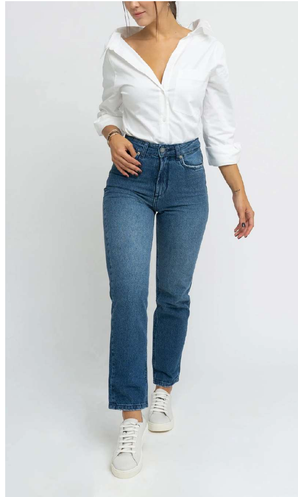
Straight Original Denim