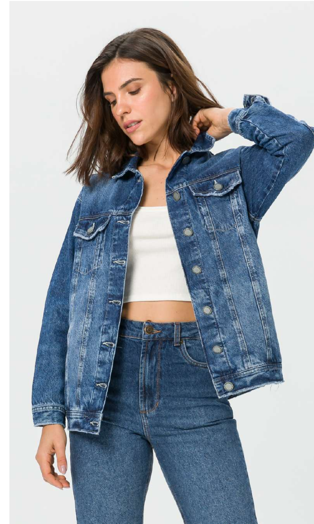
Oversized Original Denim Trucker Jacket