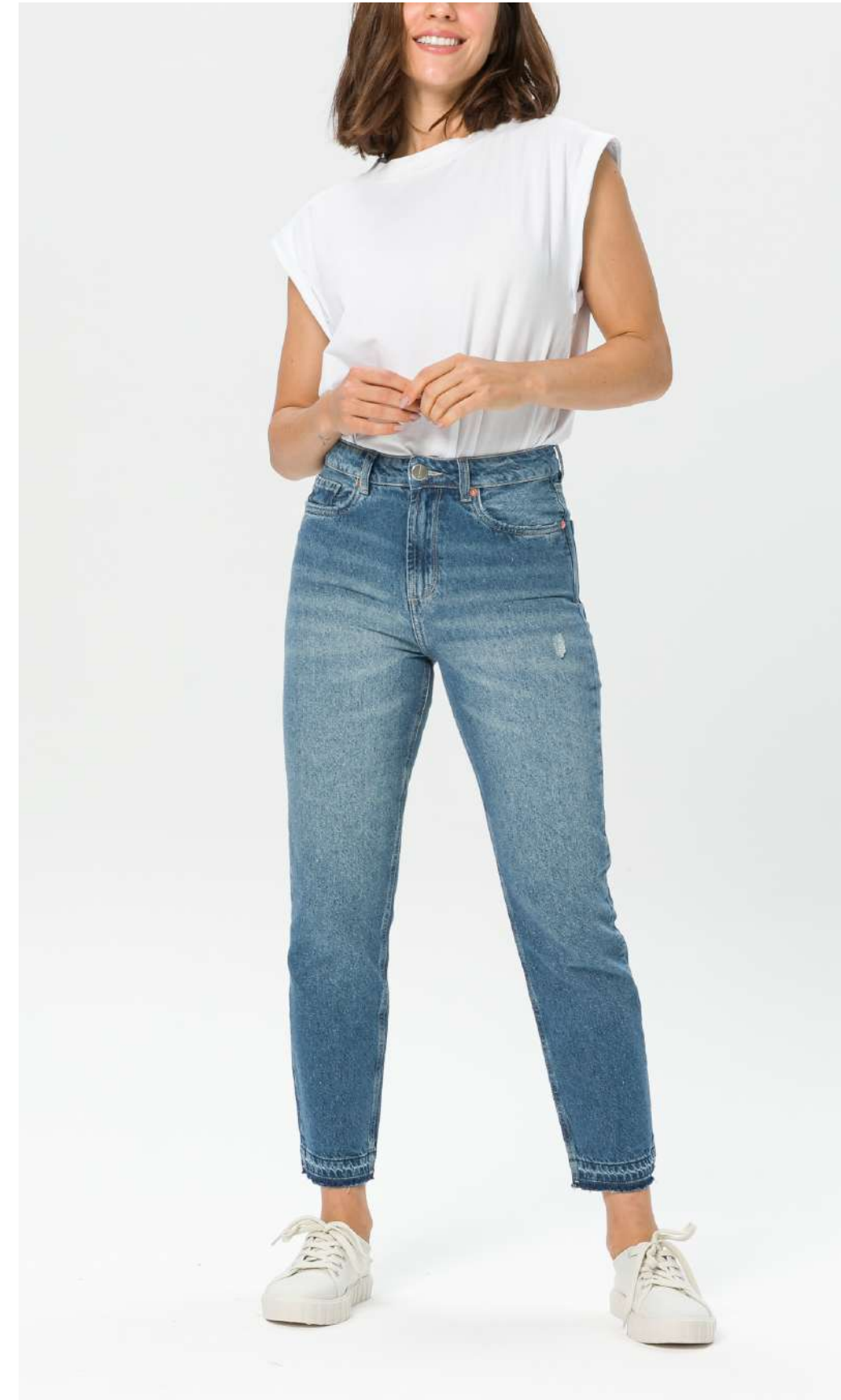
Straight Original High Waist 0/03