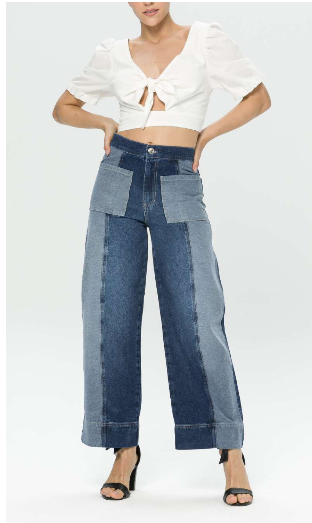
Wide Leg Expression Pockets 0/01