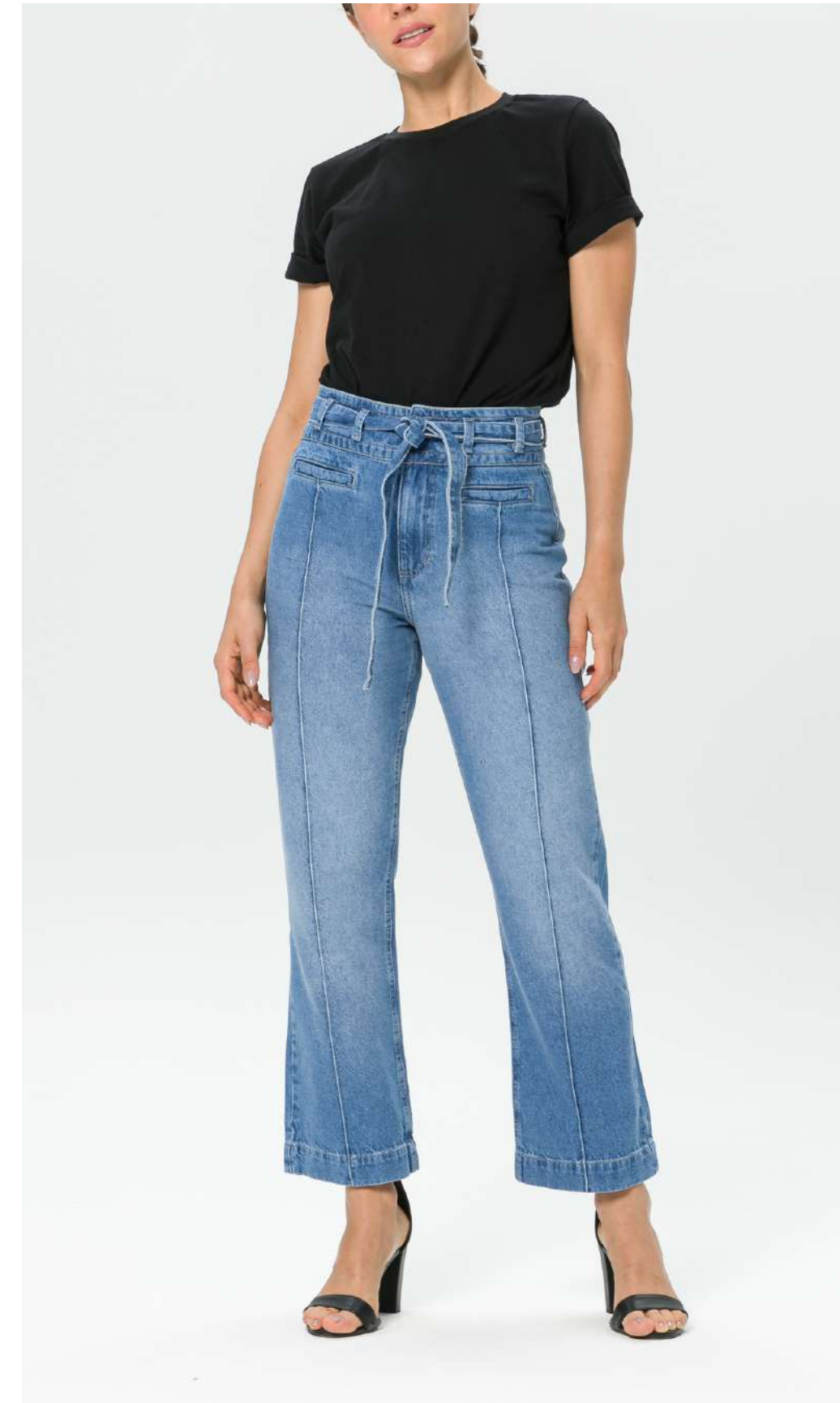
Straight Expression Belt 0/02