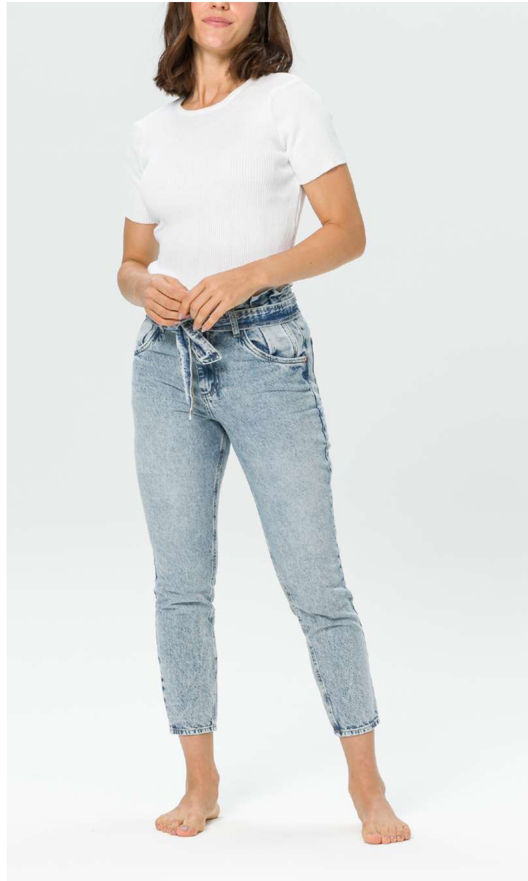
Mom Comfy Belt 0/03