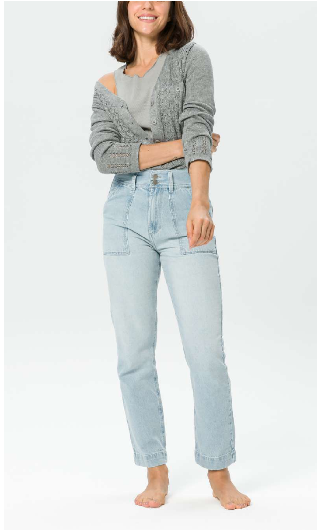
Straight Comfy Pockets 0/03