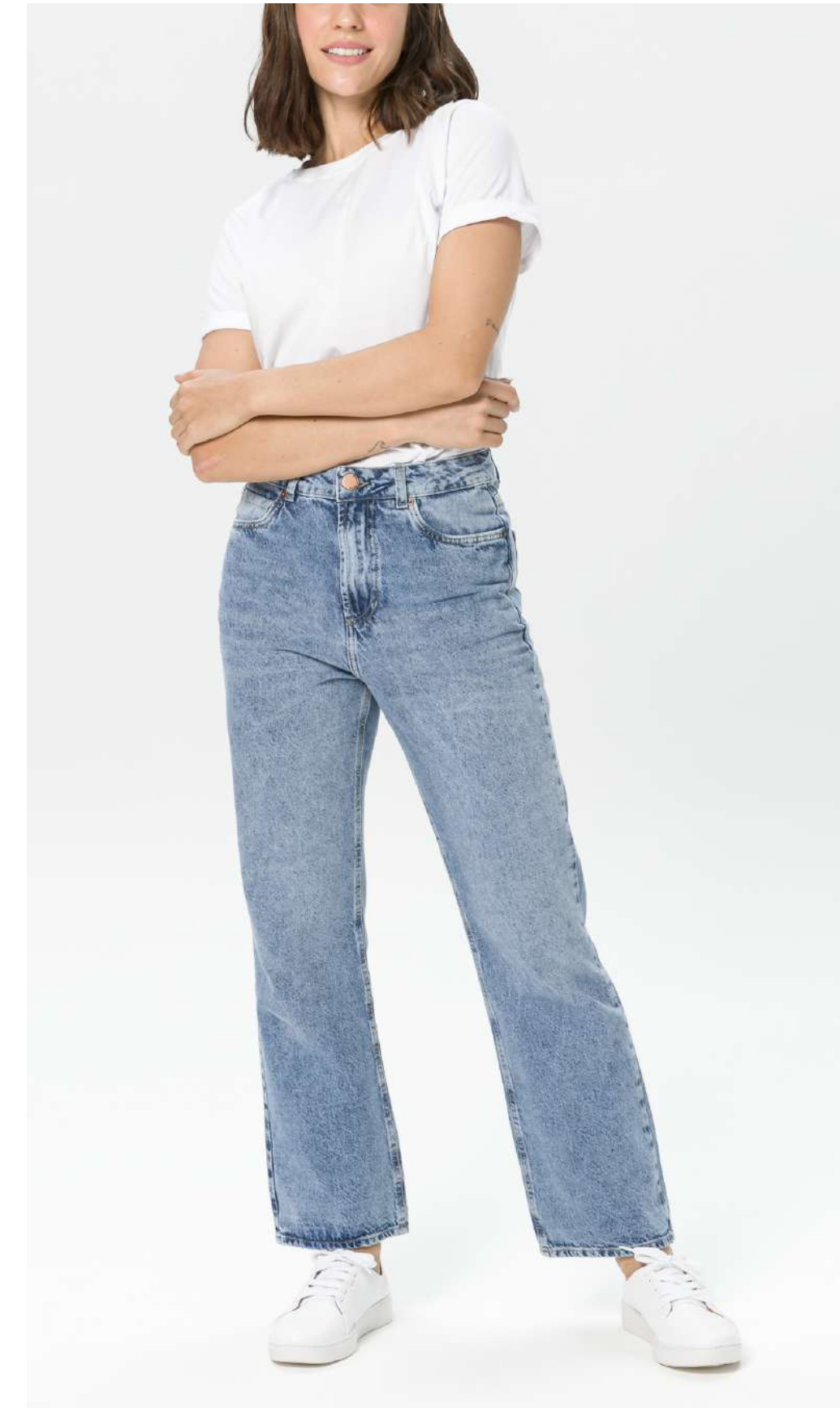
Flare Original High Waist 0/03