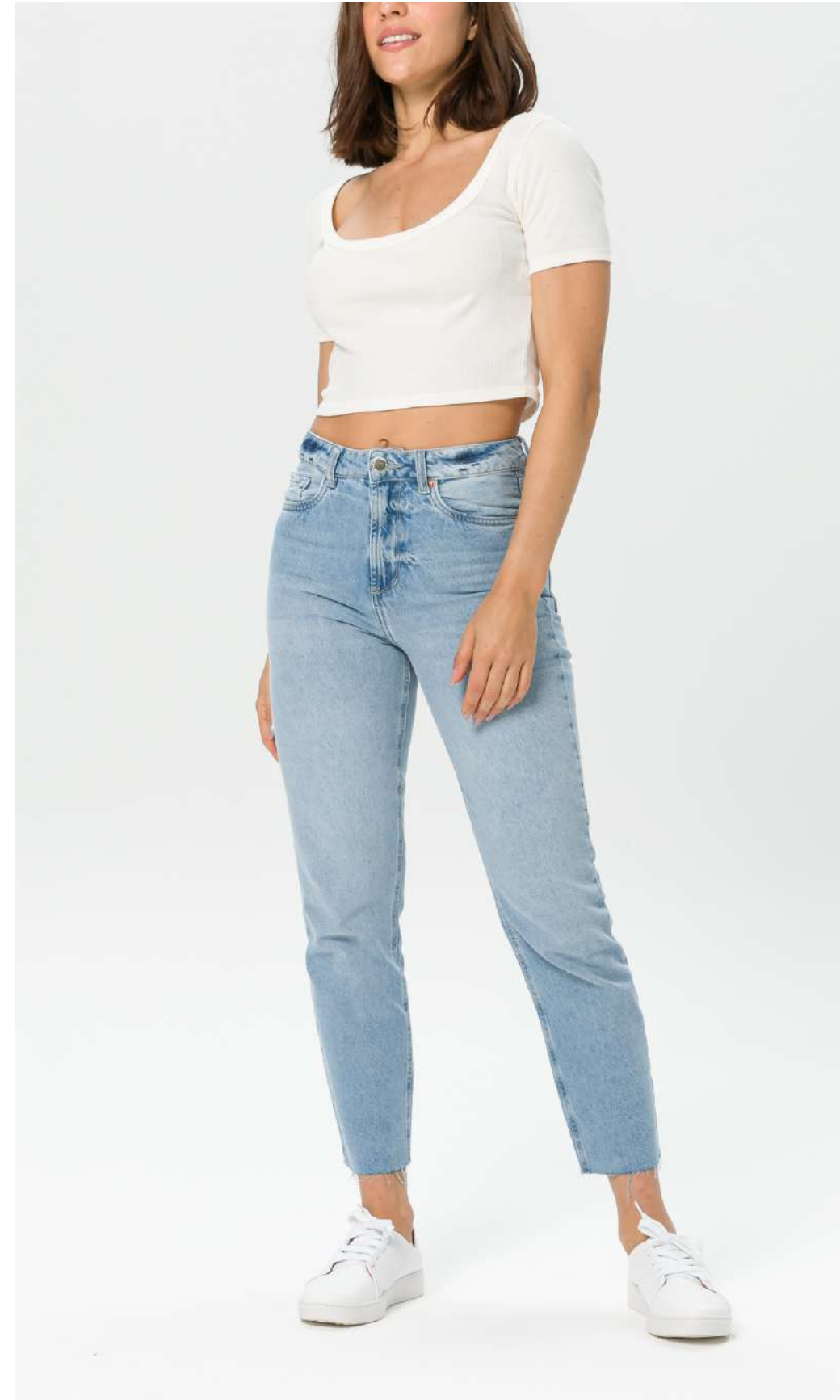
Straight Original High Waist 0/02