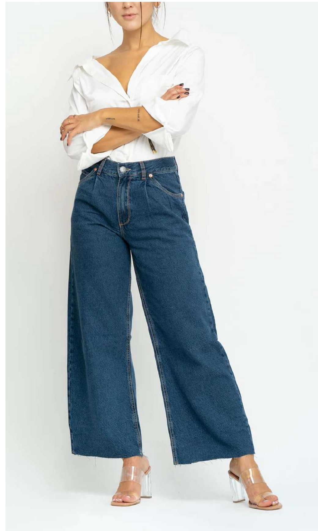
Wide Leg Details