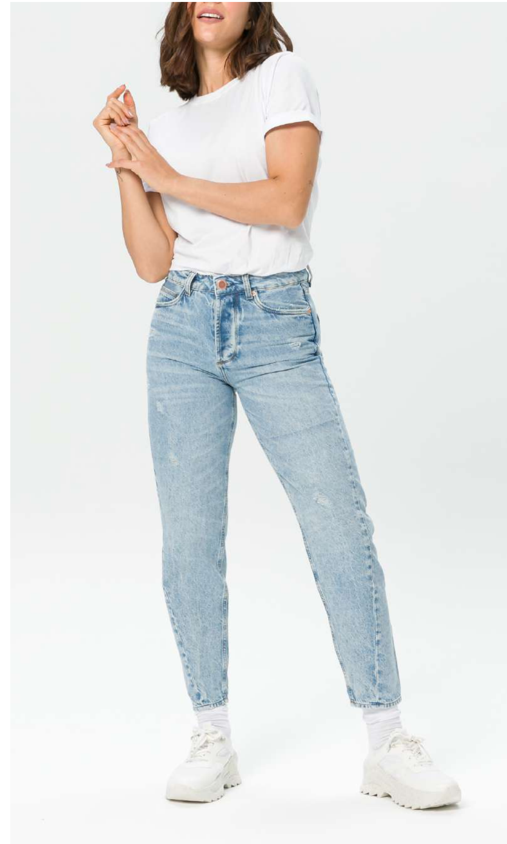
Balloon Original High Waist 0/03