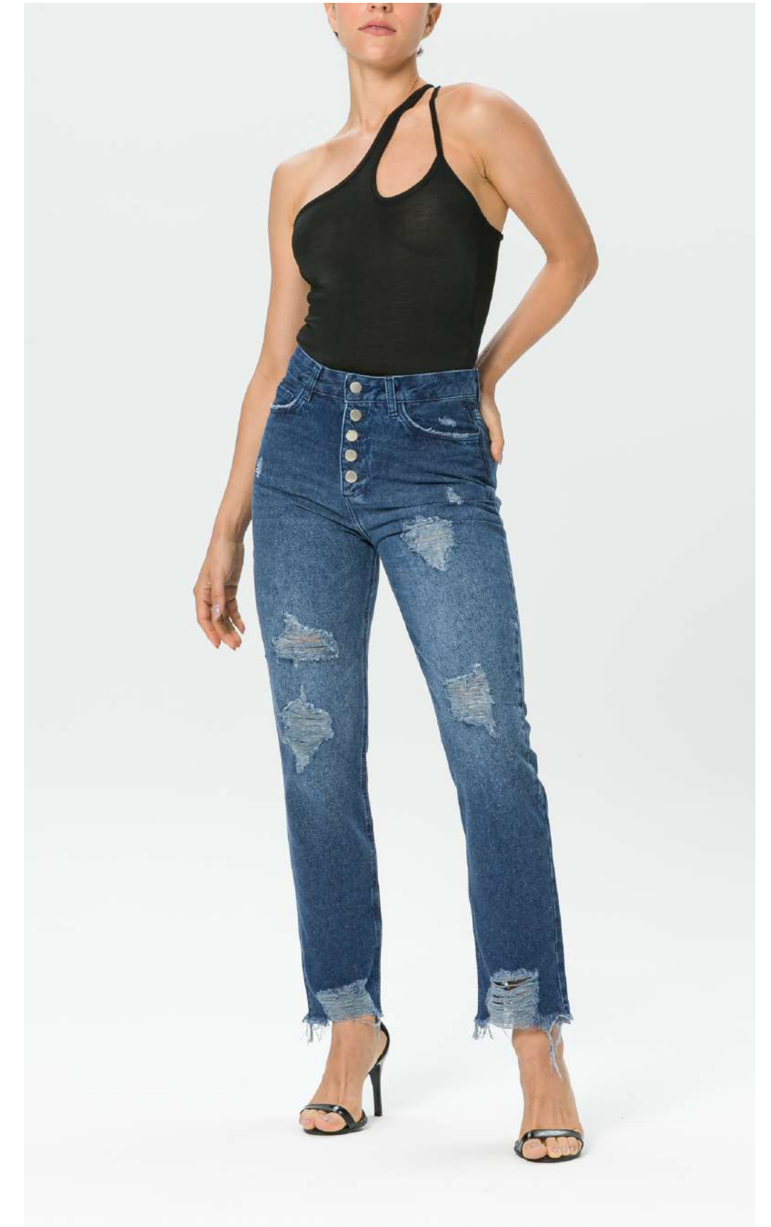
Straight Expression Ripped 0/02