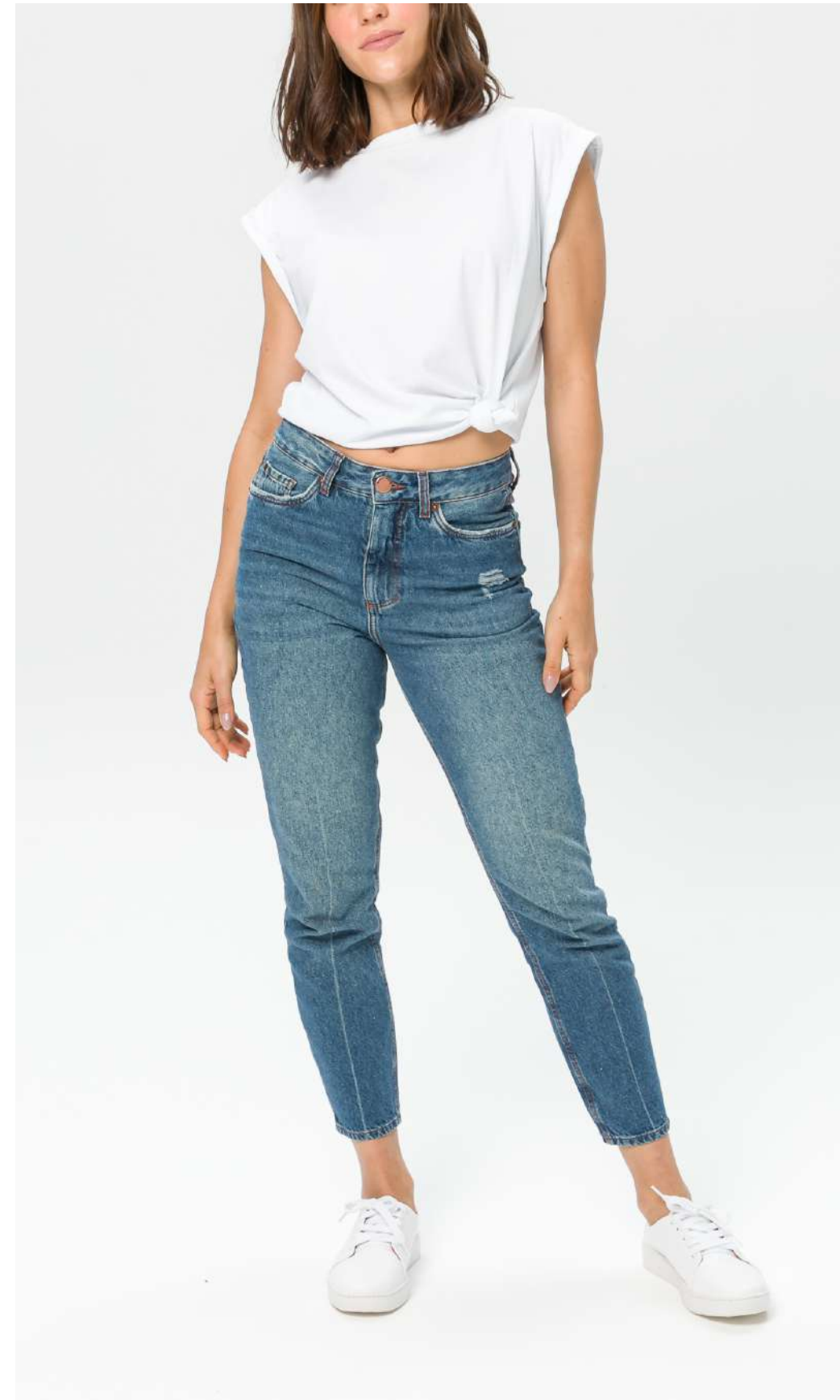
Mom Original Ripped 0/01