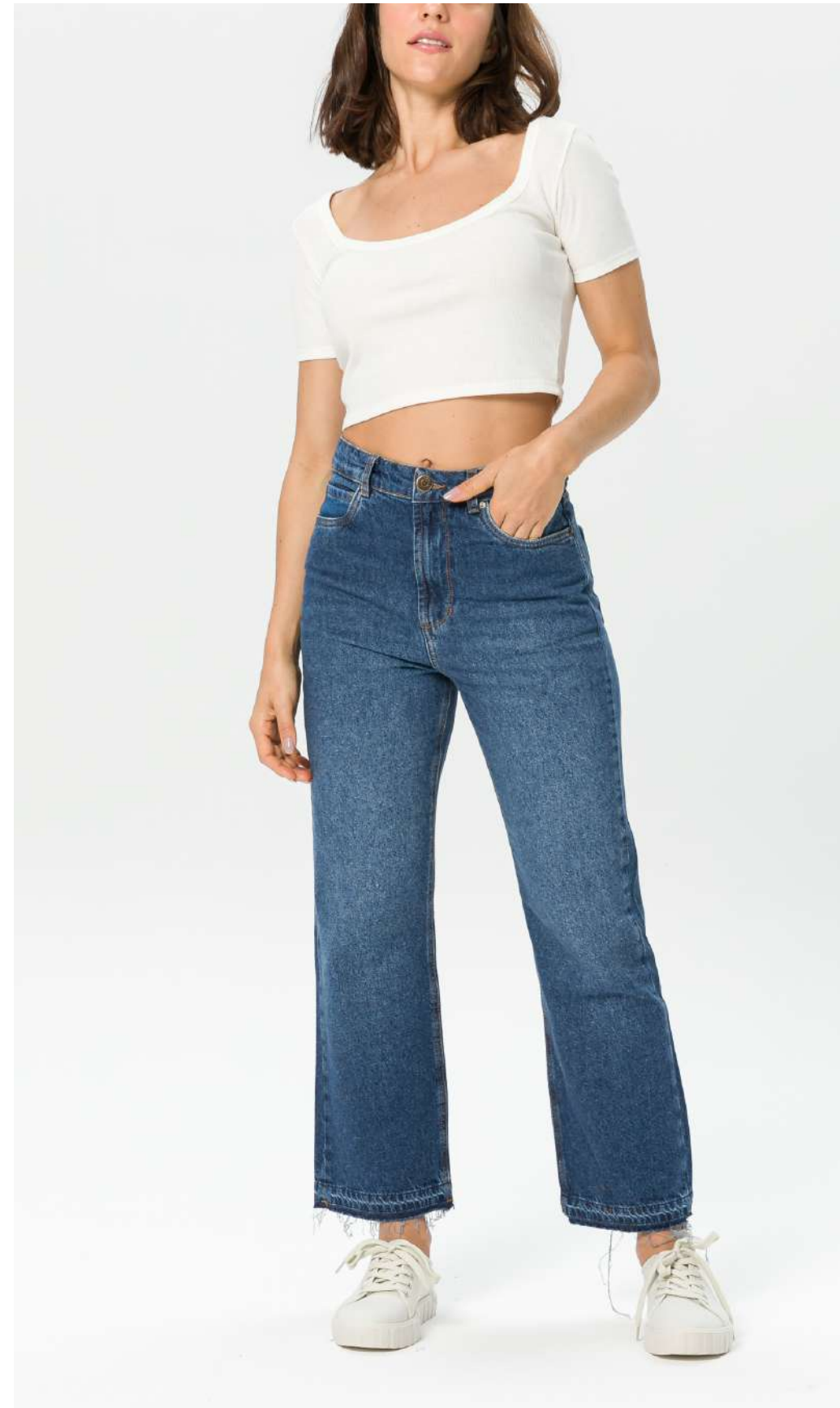
Flare Original High Waist 0/01