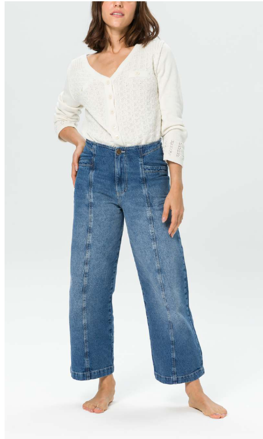
Wide Leg Comfy Details 0/01