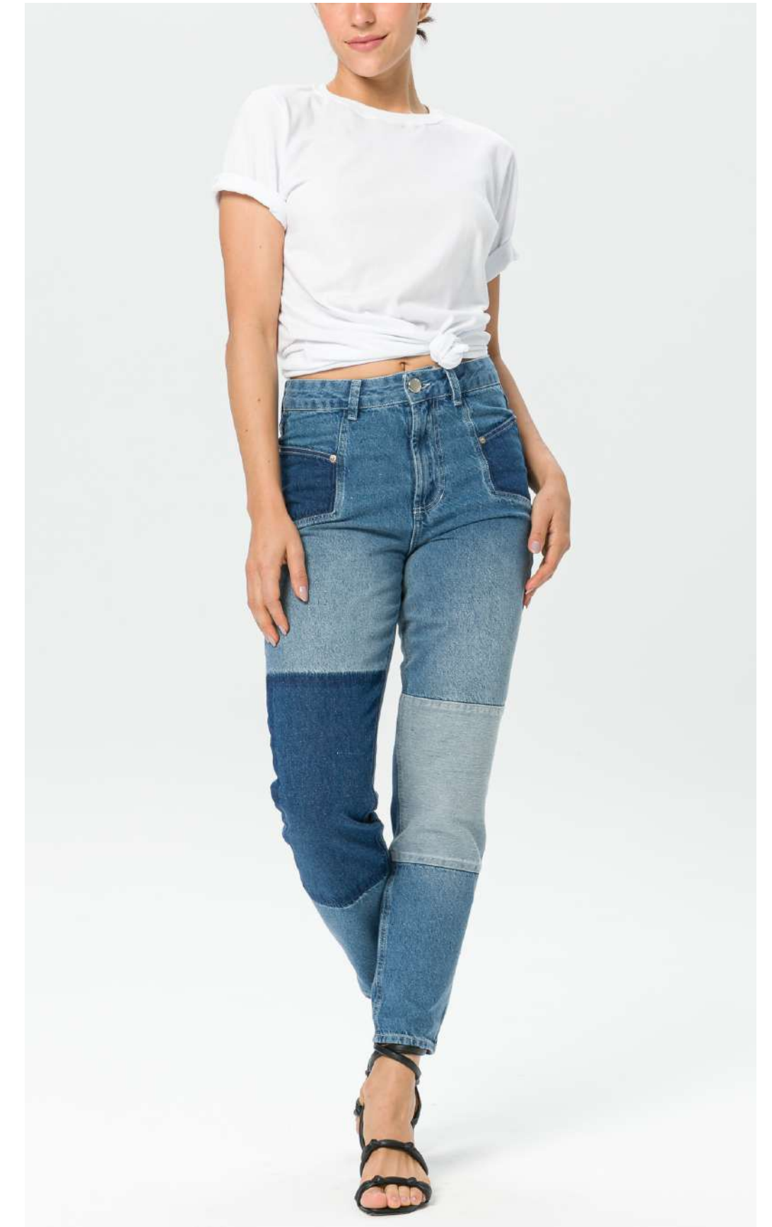
Mom Expression Details 0/02