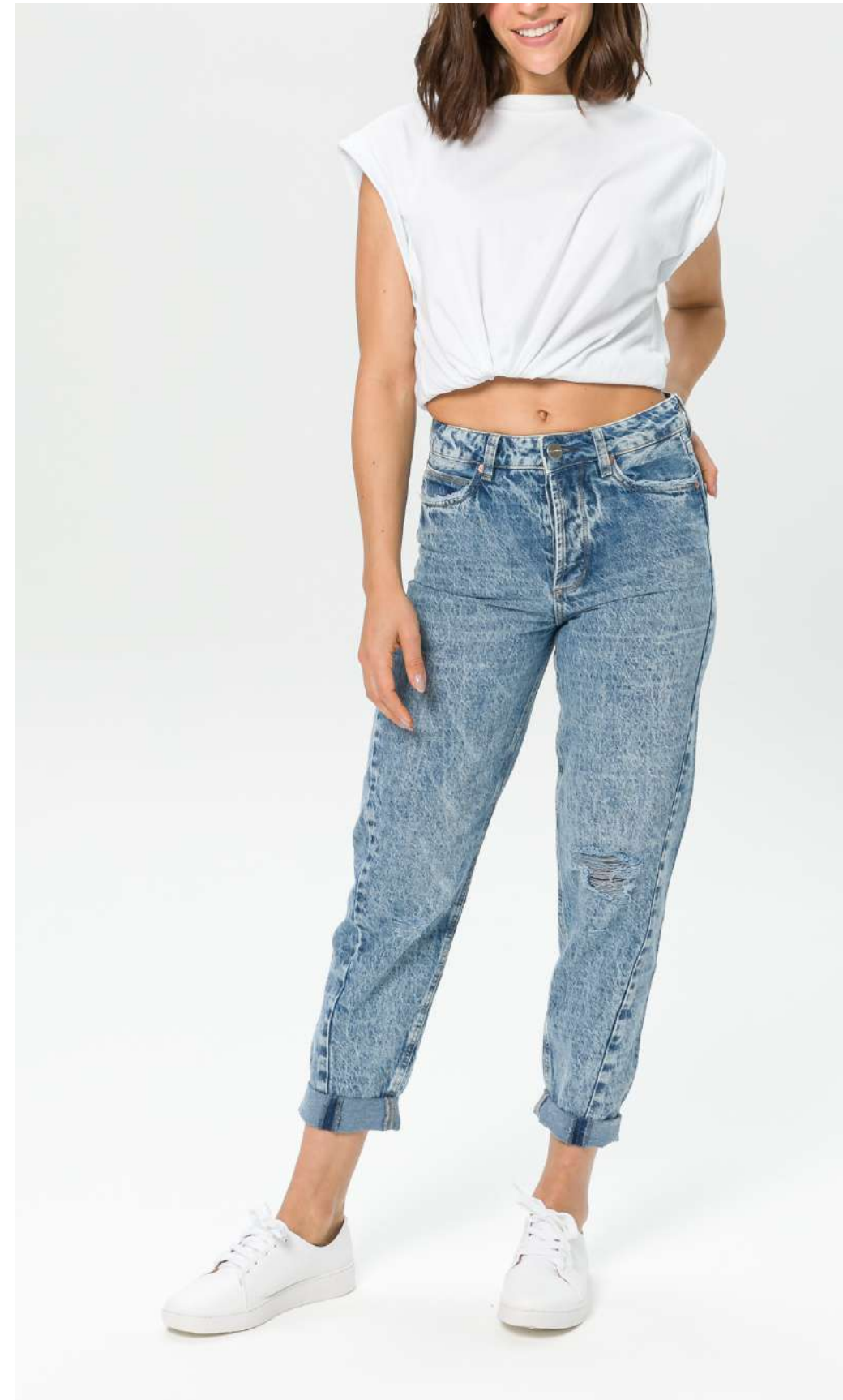
Balloon Original Ripped 0/03