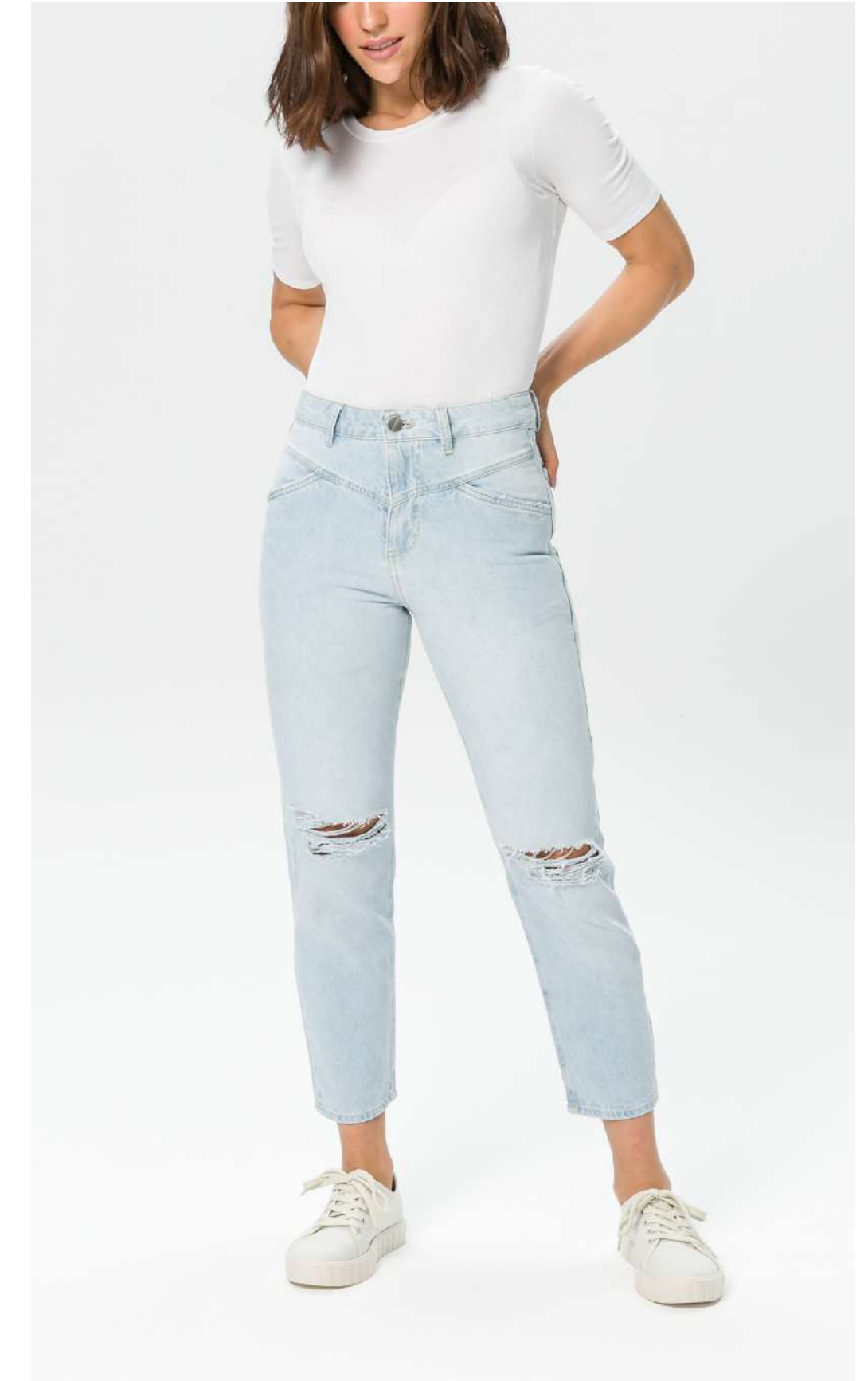
Straight Original Ripped 0/03