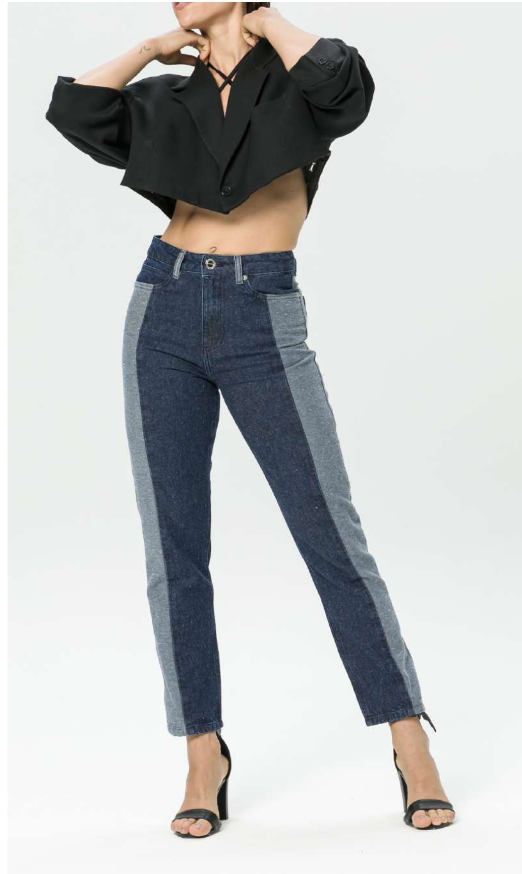
Straight Expression Details 0/01