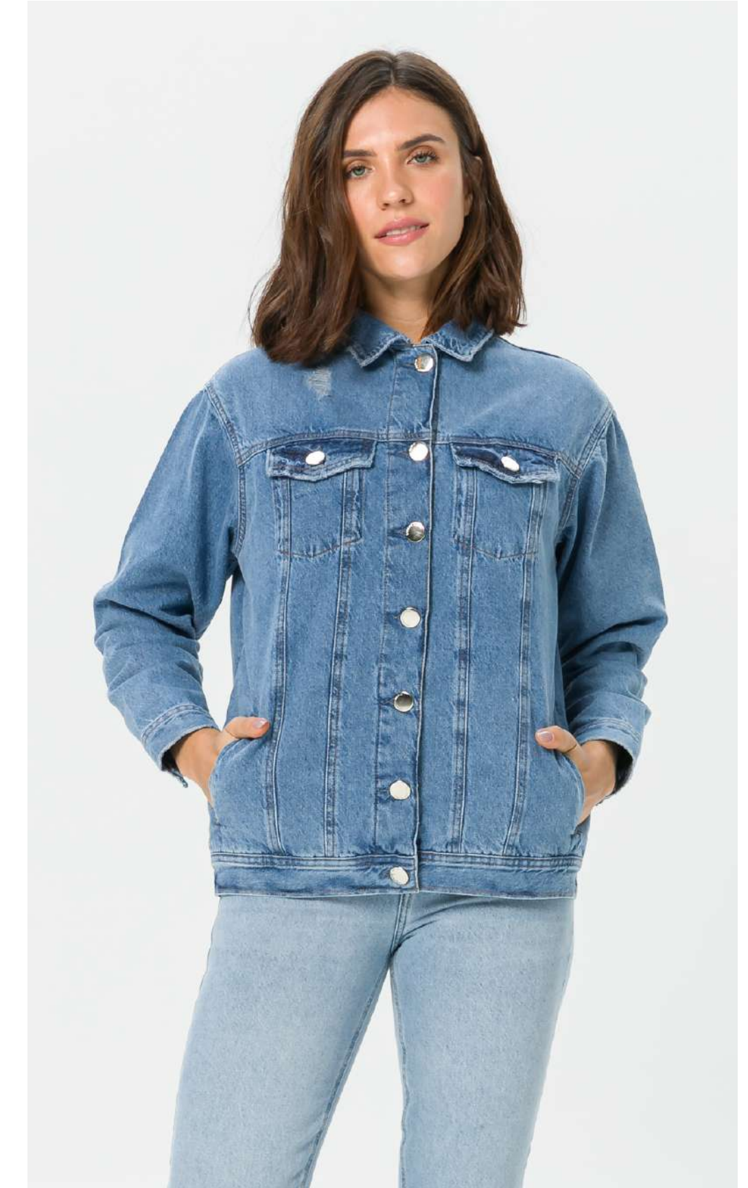
Oversized Original Trucker Jacket