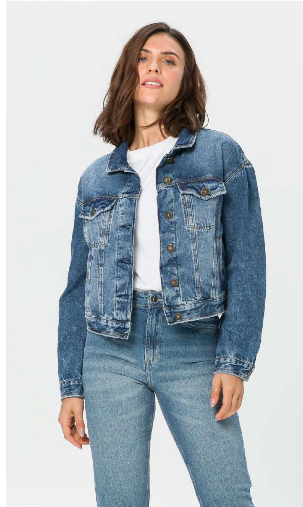
Original Denim Jacket