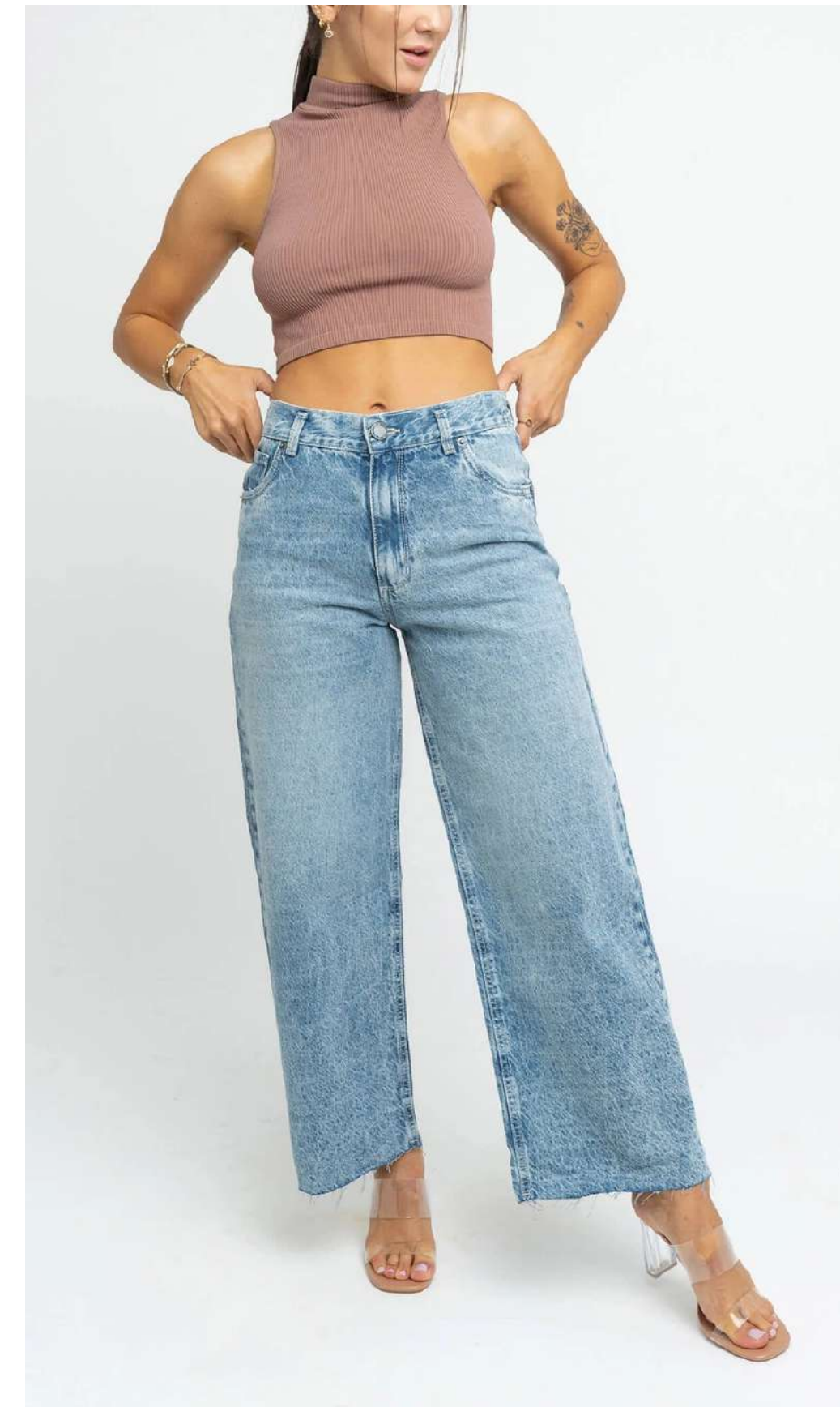
Wide Leg Cropped