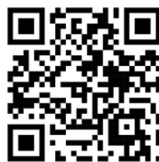
Sub Zero & Dante's Inferno