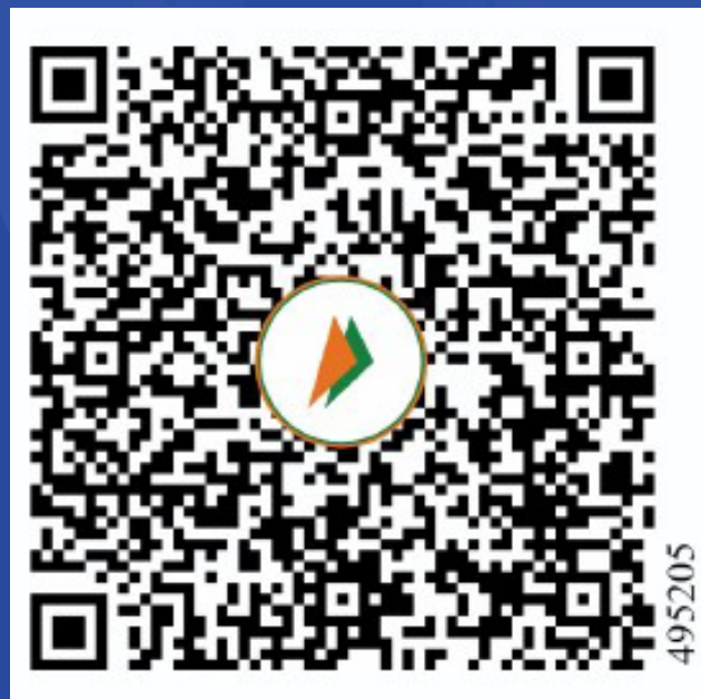
Payment QR code