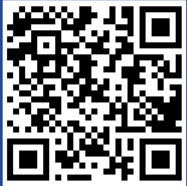
Event Registration form