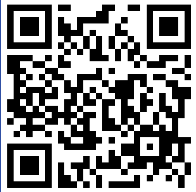
Contingent Registration QR code