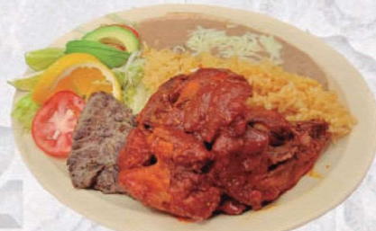
Carne asada y codorniz a la diablo (Grilled steak and cornish hen in hot diablo sauce)