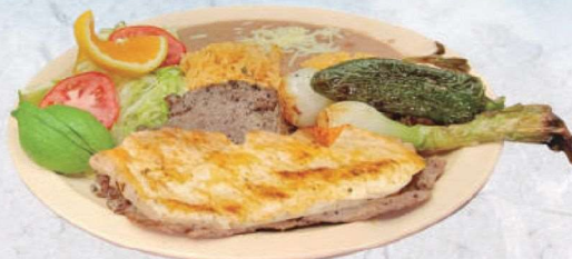
Carne asada y pechuga a la plancha (Grilled steak and chicken breast)