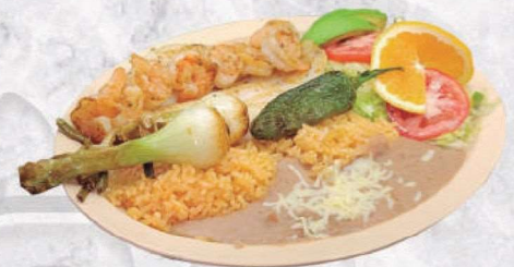
Filete y camarones a la plancha (Grilled fish fillet and shrimp)