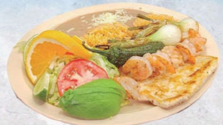
Pechuga de pollo y camarones a la plancha (Chicken breast and grilled shrimp)