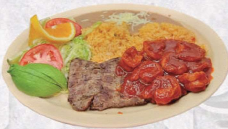
Carne asada y camarones a la diablo (Grilled steak and shrimp in hot diablo sauce)