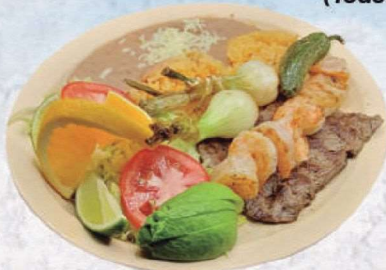
Carne asada y camarones a la plancha (Grilled steak and shrimp)

All plates are served with rice, beans, tortillas and salad (Todos los platos se sirven con arroz, frijoles, tortillas y ensalada)