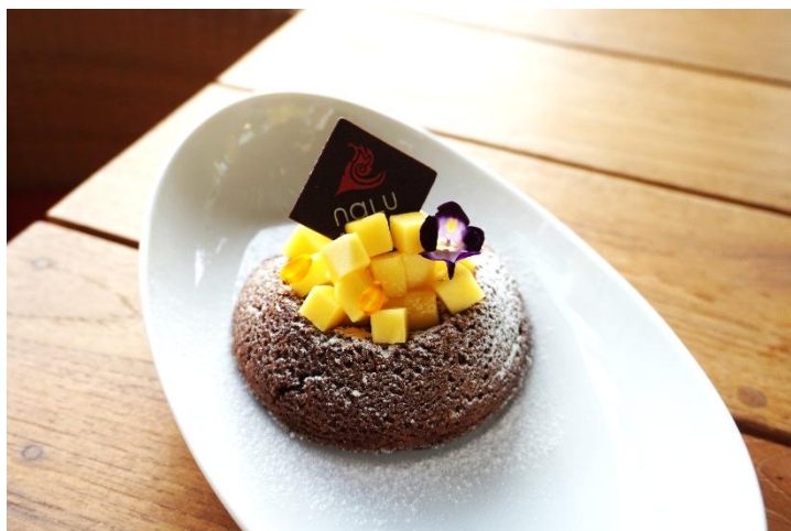
Baked Molten Chocolate Lava Baked outside, liquid inside, fresh mango 195