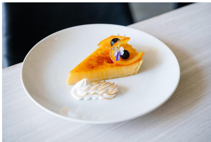
Lemon Tart Swiss meringue, candied orange 175

Ice Cream & Sorbet Scoops Vanilla, triple chocolate, Nutella, coconut, strawberry sorbet 90