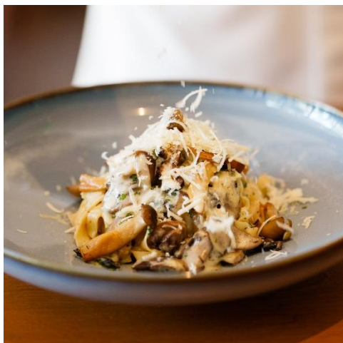
Umami XL Mushroom Pappardelle (V)

Home-made noodles, sautéed mushroom, cream sauce, truffle oil 380