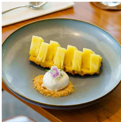
Grilled Pineapple Wedge Coconut crunch, coconut ice cream 180