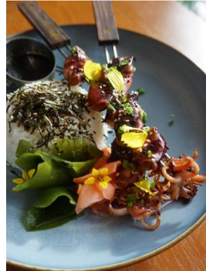
Wood fire grilled umami squid Skewer squids, japanese rice, seaweed, sesame 280