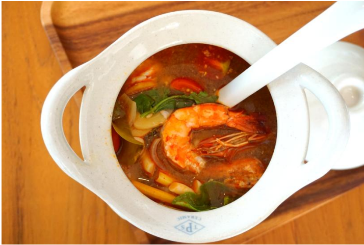
Tom Yum Goong

Spicy and sour soup with tiger prawn, lemongrass, galangal, chili, lime 355