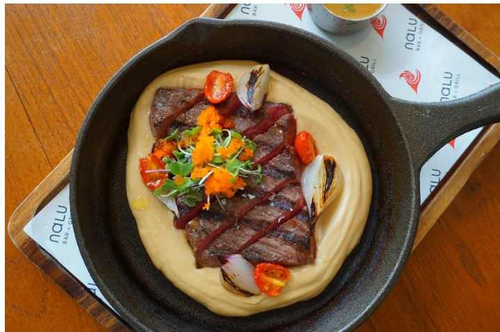
Grilled Wagyu Beef Sirloin