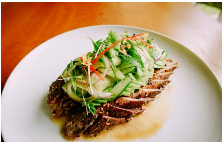
Charred Skipjack Tuna 200g Spicy marinated, medium rare, lime and garlic green dipping sauce 480