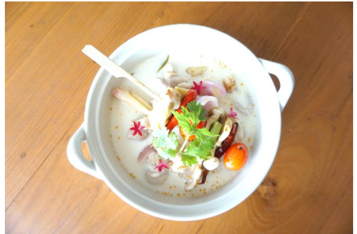
Tom Kha Gai

Spicy and sour soup with tiger prawn, lemongrass, galangal, chili, lime 355