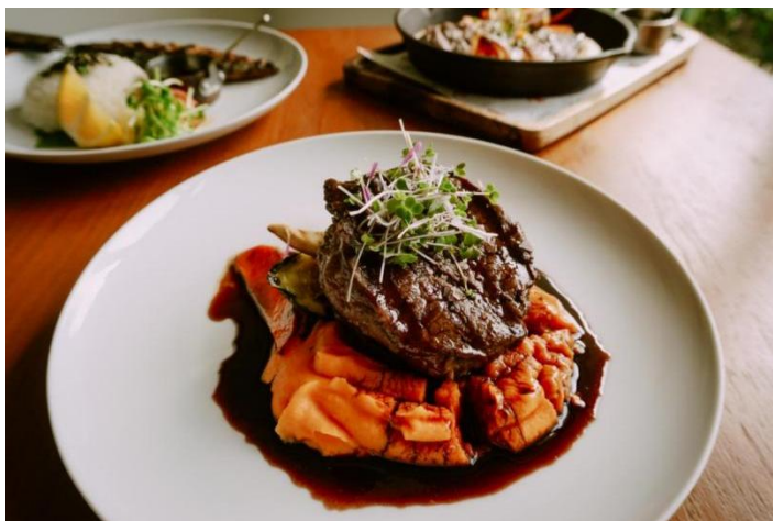
Beef Tenderloin, 120 days grain fed