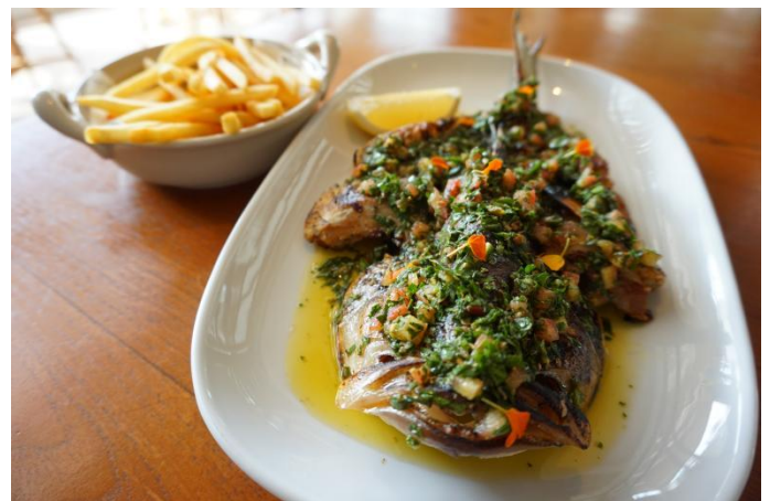
Charcoal Grilled Andaman Grouper 600gr Whole fish, sauce vierge, burnt lemon, shoestring fries 830