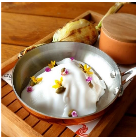
Kao Nhie Ma Muang Mango and sticky rice with coconut milk 180