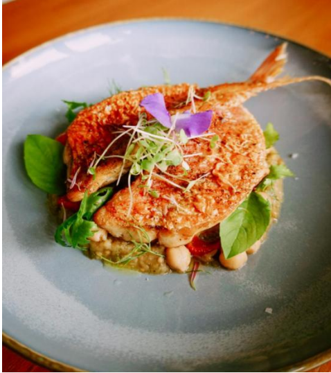
Grilled Andaman Red Mullet Butterfly cut charcoal grilled, charred eggplant, chickpea 380