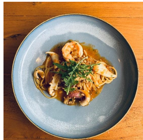
Spicy Seafood Pasta

Home-made noodles, sautéed mushroom, cream sauce, truffle oil 380