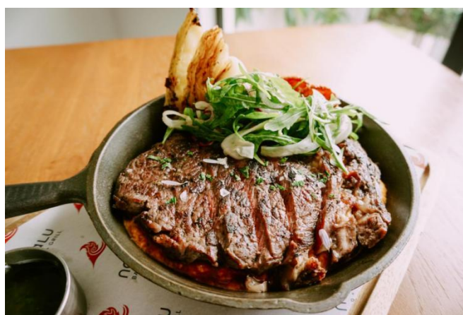
Thai Spicy Beef Ribeye