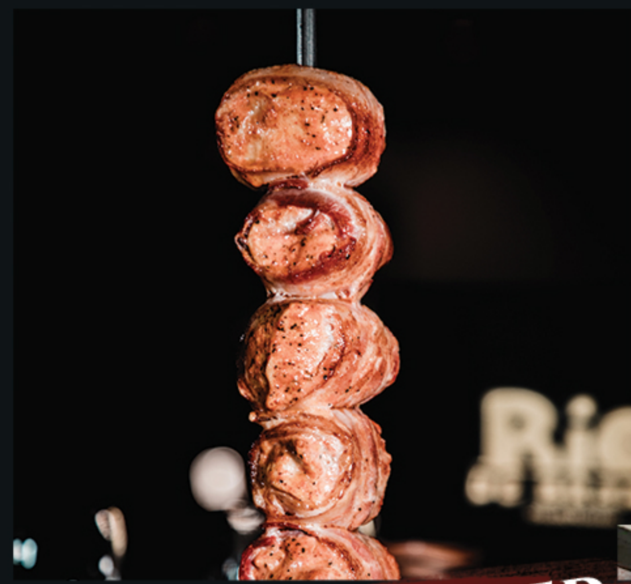
BACON WRAPPED CHICKEN