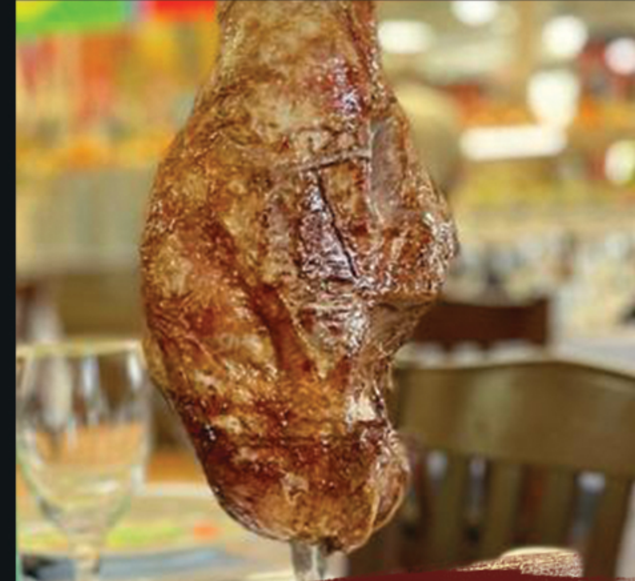
LEG OF LAMB