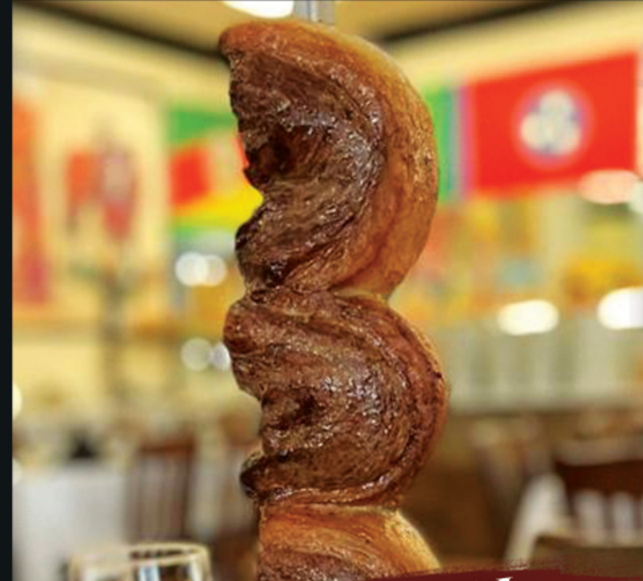
HOUSE SPECIAL PICANHA