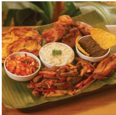
Jr. Countryman's Barbecue