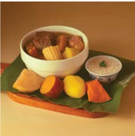
Beed & Vegetables Soup