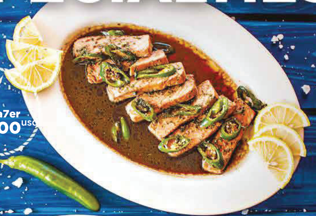
Tuna 3al Ba7er $25.00 USD