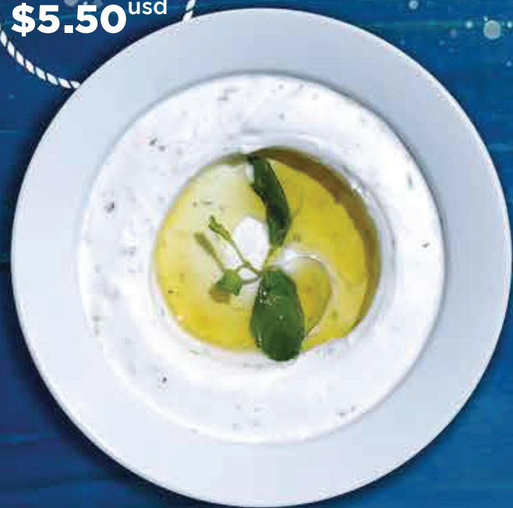
Labneh bi Toun $5.50 usd