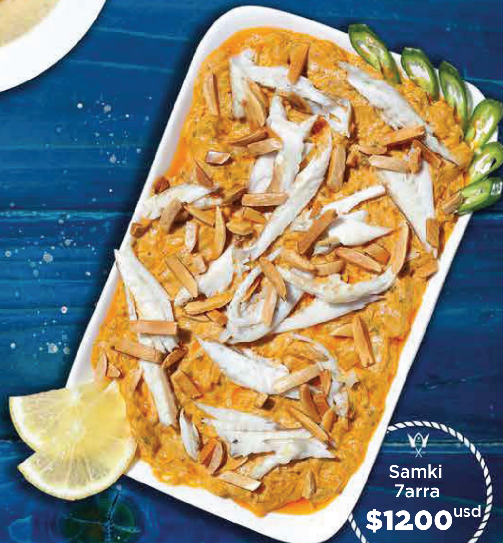
Samki 7arra $12.00 usd