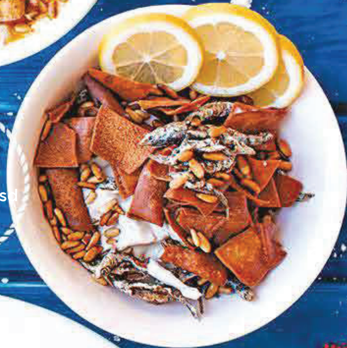
Fattet Bezreh $17.00 USD