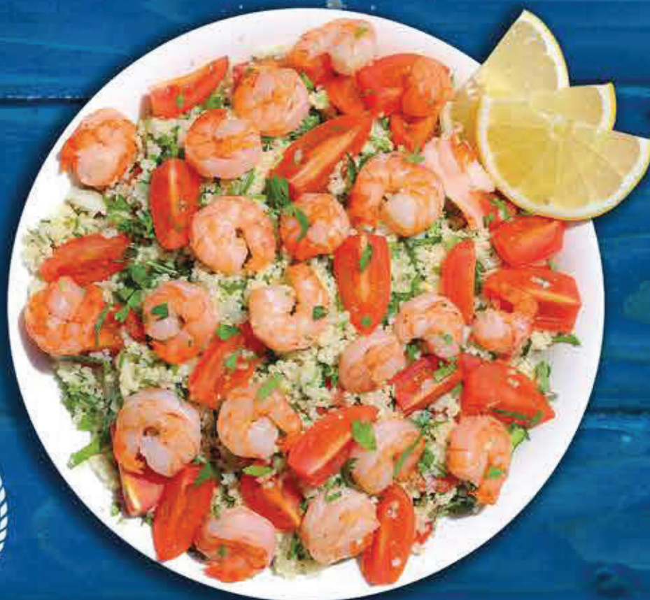
Shrimp Tabbouleh $17.50 usd