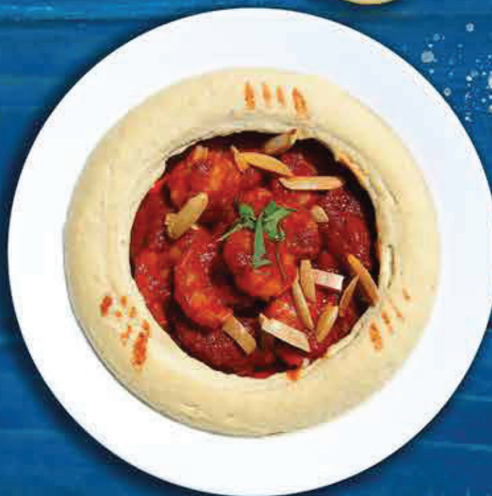
Shrimp Hommos $15.00 usd