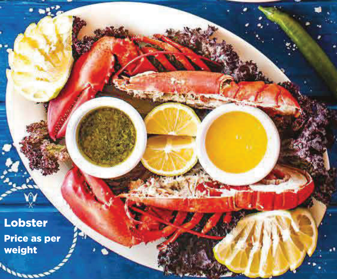
Lobster Price as per weight