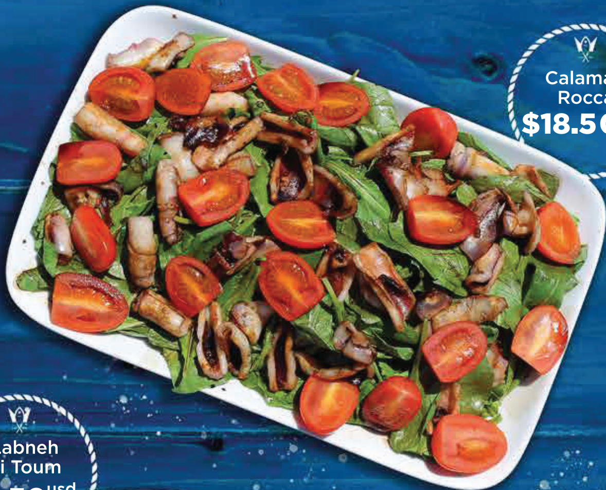
Calamari Rocca $18.50 usd