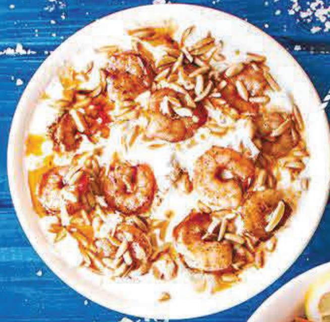
Shrimp Fattah $22.00 USD