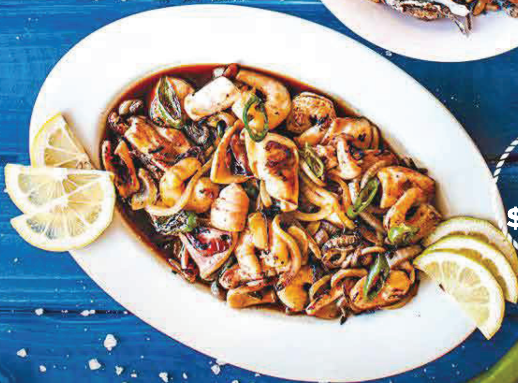
Mix 3al Ba7er $35.00 USD