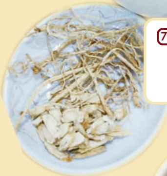
702 Ginseng Chicken Soup 洋參須雞湯 RM 15.80