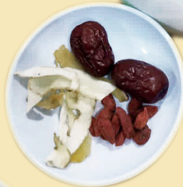
703 Nourishing ABC Soup 蘿蔔馬鈴薯湯 RM 8