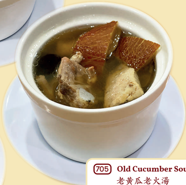
705 Old Cucumber Soup 老黃瓜老火湯 RM 8