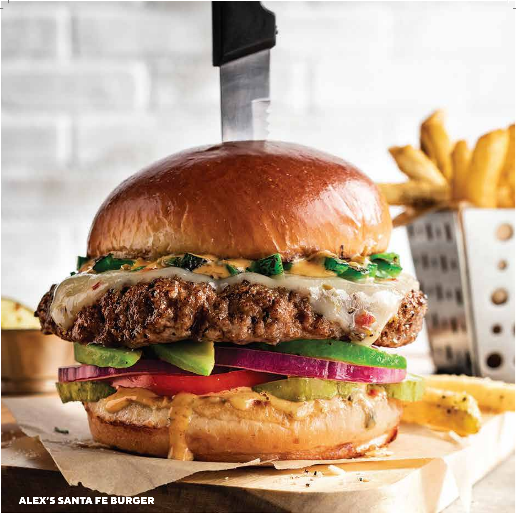
ALEX’S SANTA FE BURGER

Stacked high with premium smokehouse flavors. Beef bacon, cheddar, pickles, onion rings, lettuce, tomato, garlic aioli. Served with a side of original BBQ sauce. BD 6.900