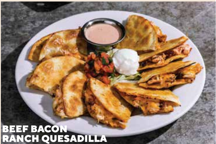
BEEF BACON RANCH QUESADILLA