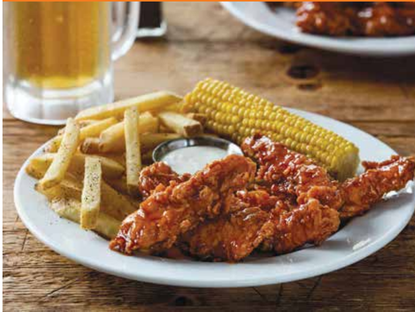
CRISPY HONEY-CHIPOTLE CHICKEN CRISPERS Served with house-made ranch. BD 6.300

100% WITH WHITE MEAT CHICKEN, SERVED WITH CORN ON THE COB & FRIES.