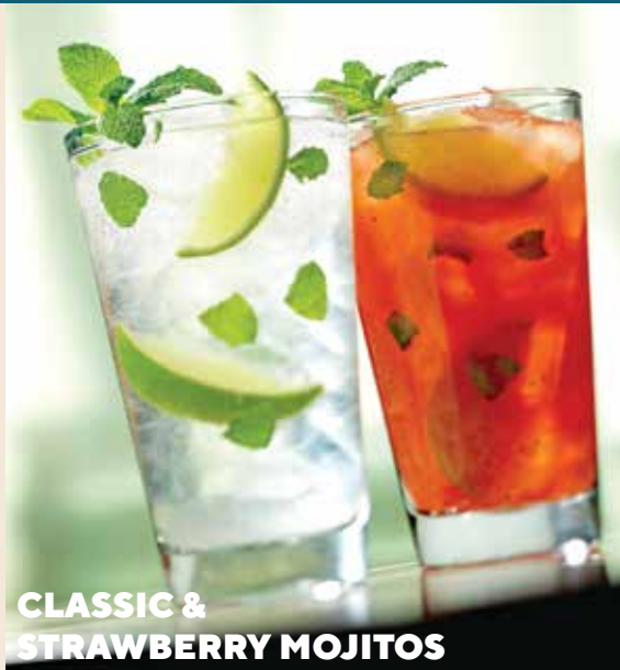
CLASSIC & STRAWBERRY MOJITOS

FLAVOURED SODA BD 1.900 •Vanilla •Cherry •Grenadine