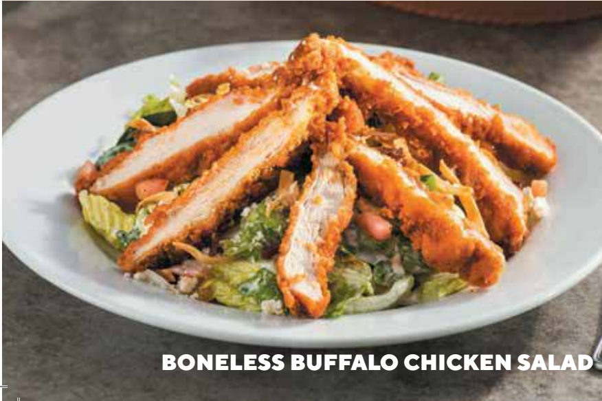
BONELESS BUFFALO CHICKEN SALAD

Ask you server for today's selection. Bowl BD 3.100 Cup BD 2.200