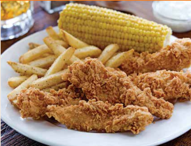
CRISPY CHICKEN CRISPERS Served with choice of honey-mustard, BBQ sauce, house-made ranch. BD 6.300