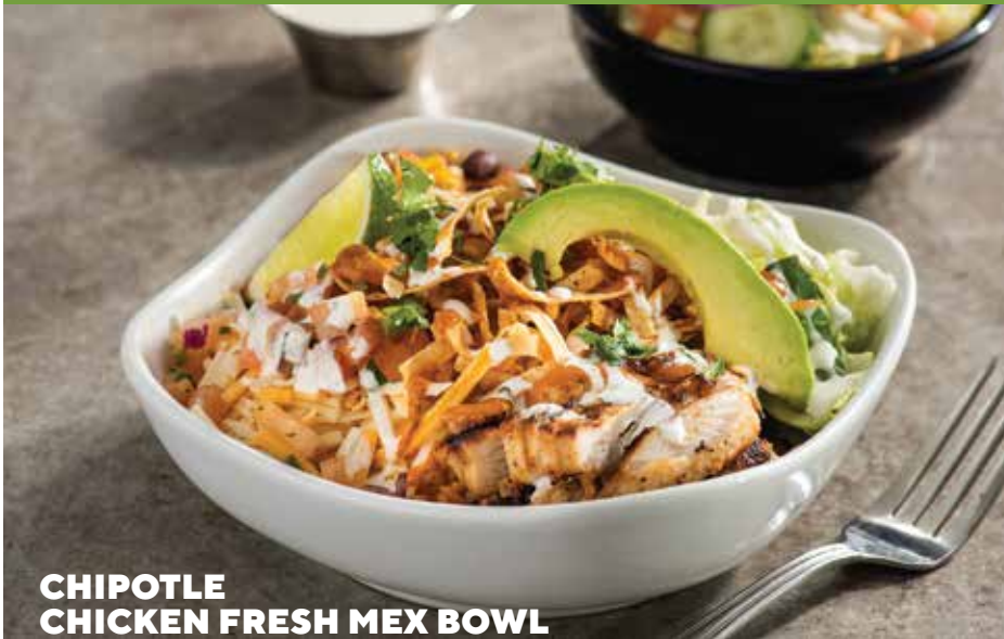
CHIPOTLE CHICKEN FRESH MEX BOWL