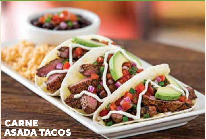
CARNE ASADA TACOS