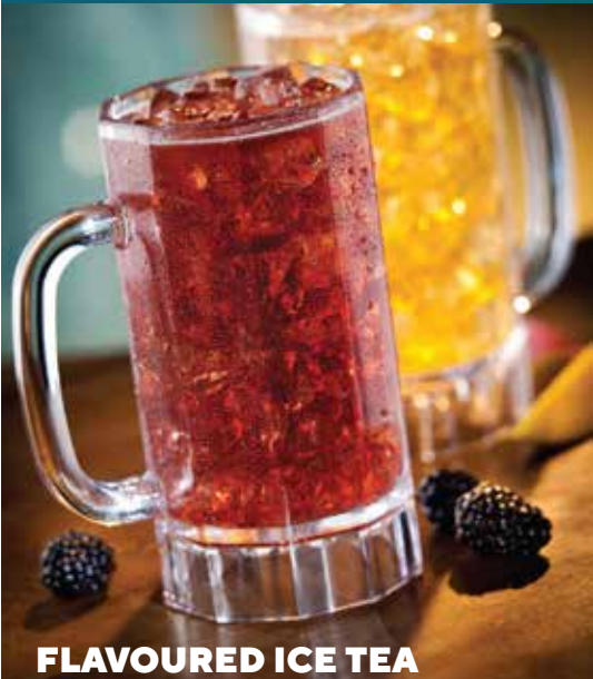
FLAVOURED ICE TEA