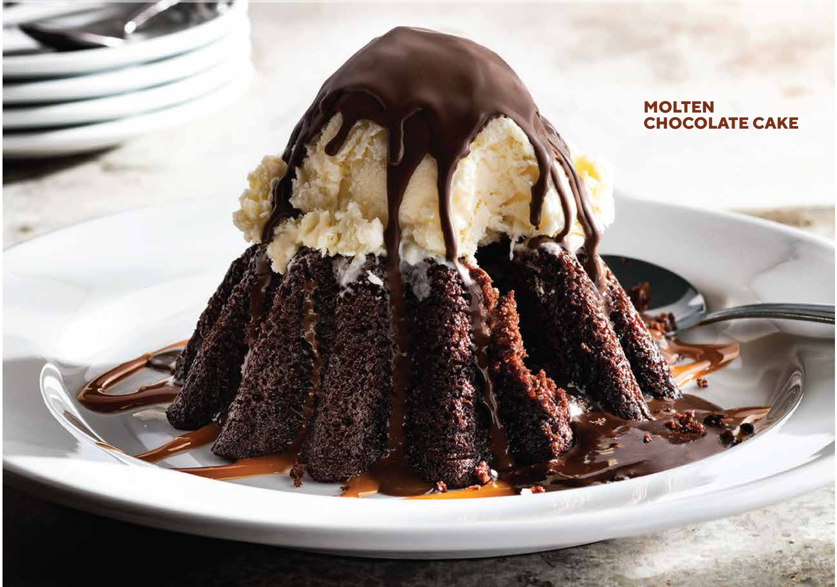
MOLTEN CHOCOLATE CAKE

A chocolate lover's delight. Our classic cake filled with a warm molten center, plus vanilla ice cream coated in a chocolate shell. BD 4.300