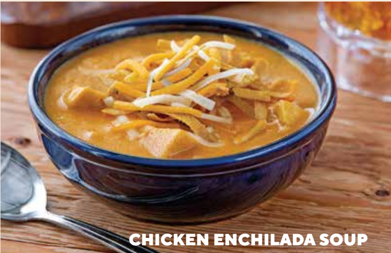
CHICKEN ENCHILADA SOUP