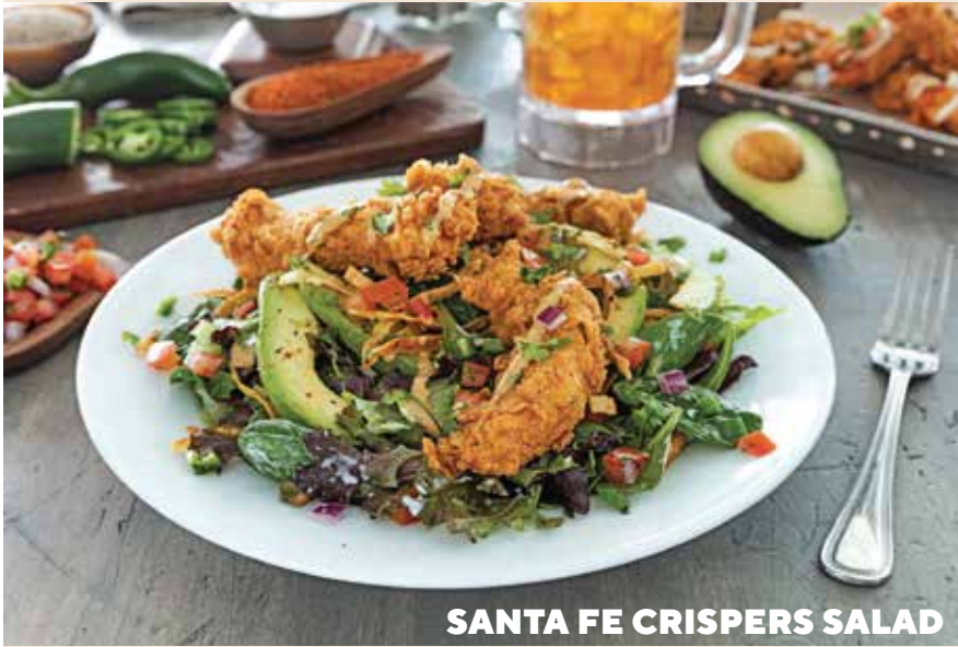
SANTA FE CRISPERS SALAD

Grilled chicken, cheese, tomatoes, corn & black bean salsa, tortilla strips and citrus-balsamic on mixed greens. Then, BOOM, topped with our cheese quesadillas. BD 5.700