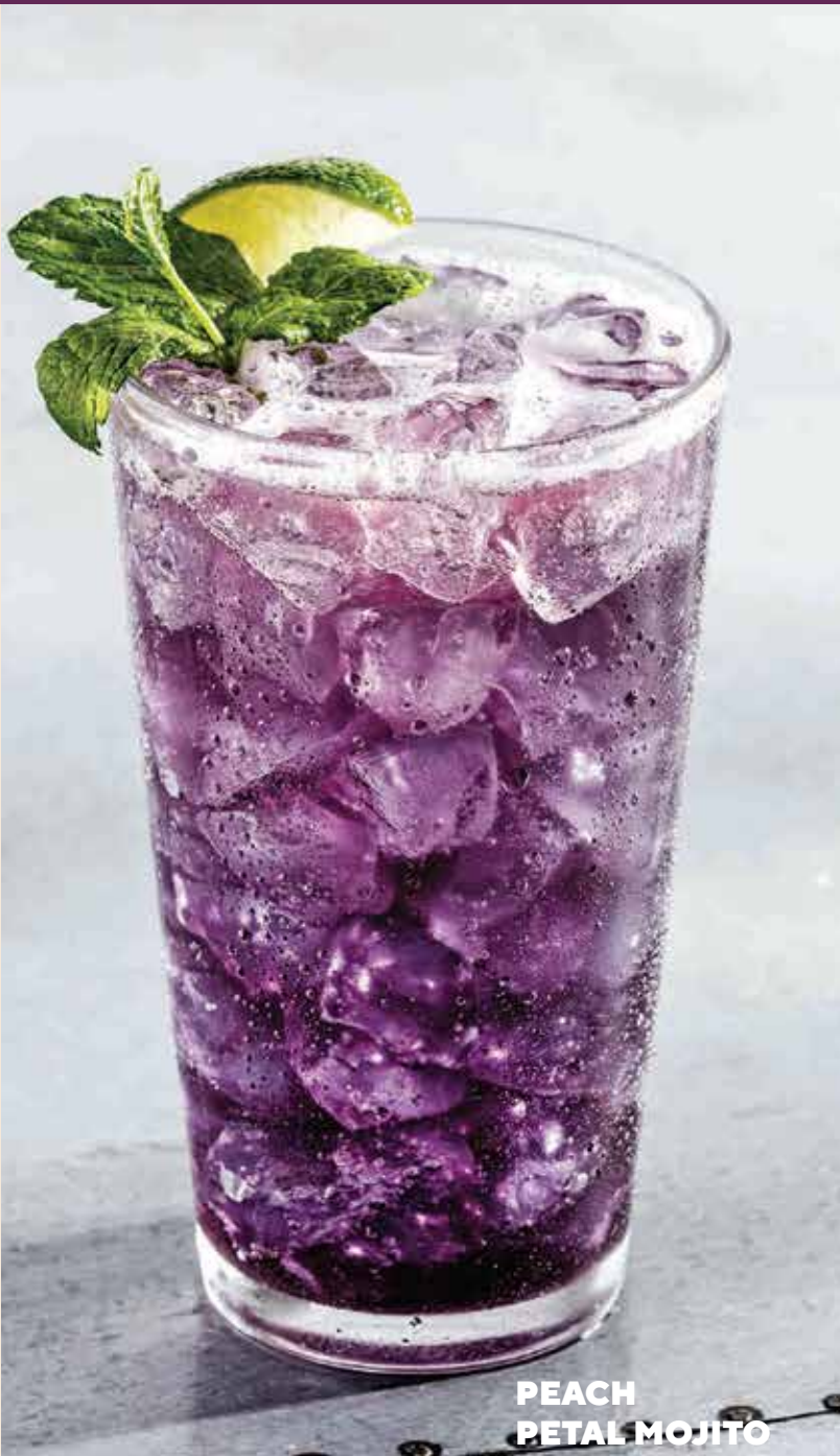
PEACH PETAL MOJITO

Take your margarita to the next level of fruits! A sweet and tart combination of mango and pomegranate. BD 2.100