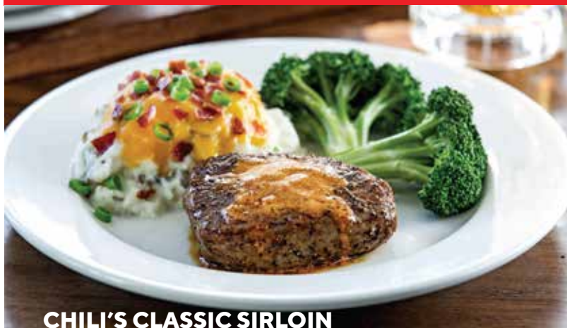
CHILI'S CLASSIC SIRLOIN