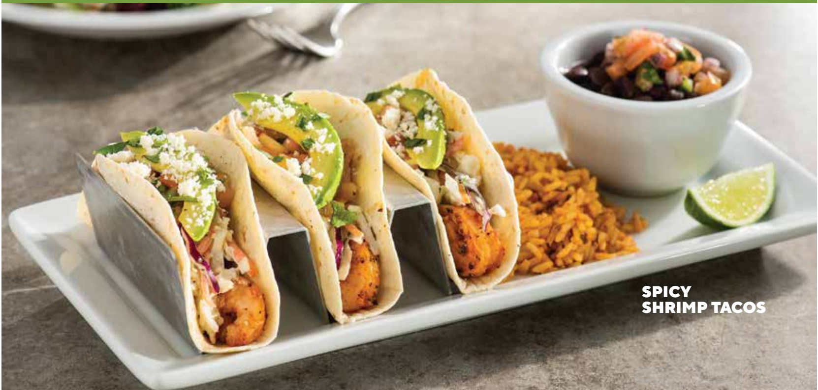
SPICY SHRIMP TACOS