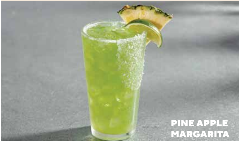
PINE APPLE MARGARITA