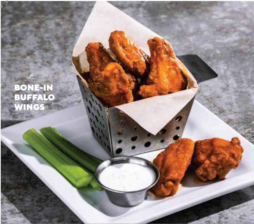
BONE-IN BUFFALO WINGS